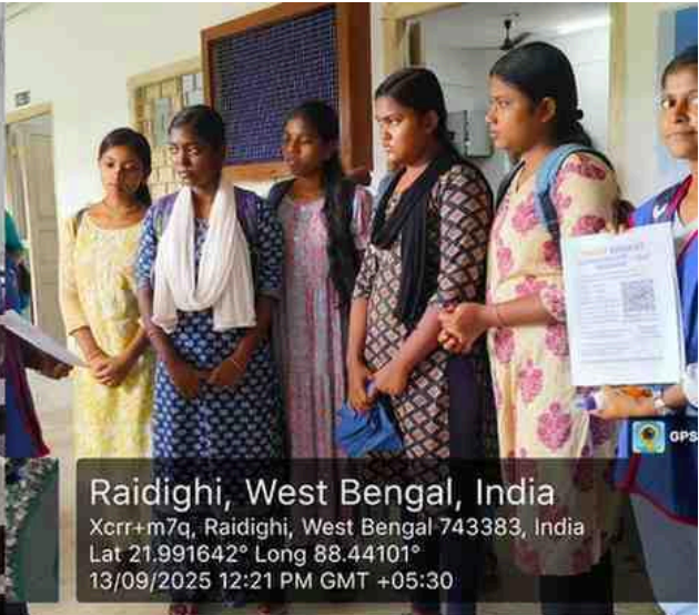
Raidighi, West Bengal, India Xcrr+m7q, Raidighi, West Bengal 743383, India Lat 21.991642° Long 88.44101° 13/09/2025 12:21 PM GMT +05:30